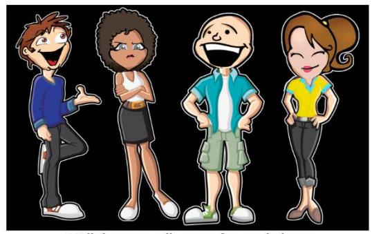
Will the counsellor step forward please

There are many similar stories, depending on whether professionals are