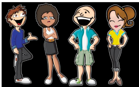
Will the counsellor step forward please

There are many similar stories, depending on whether professionals are